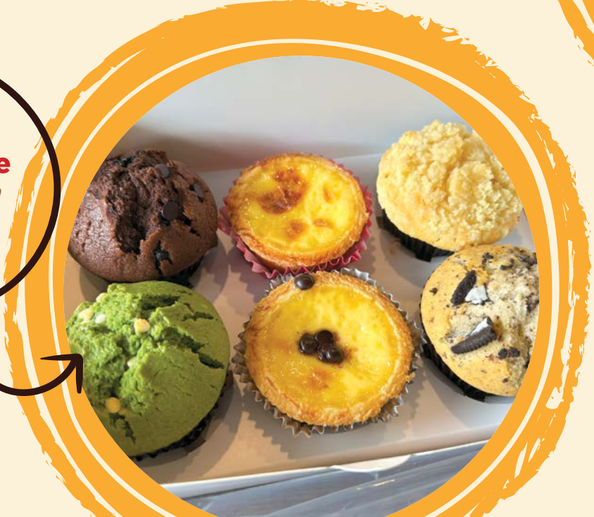
Muffin Homme @ Bukit Canberra Hawker Centre #01-48