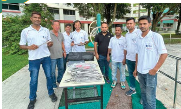
Page 6-7 Clean & Green Day