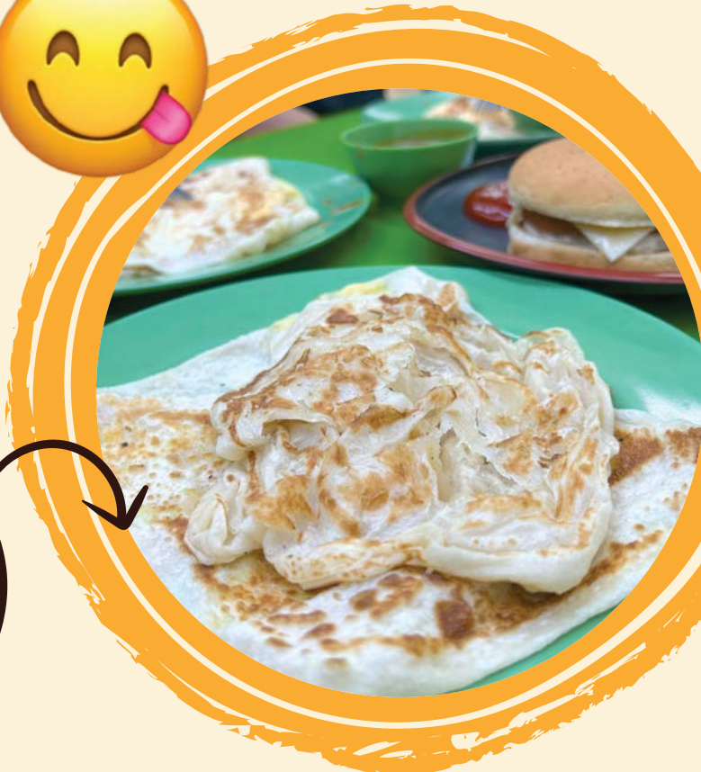
Al-Ameen @ Blk 501A Wellington Circle