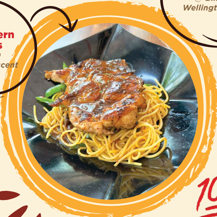
Ace Western Delights @ Blk 120 Canberra Crescent