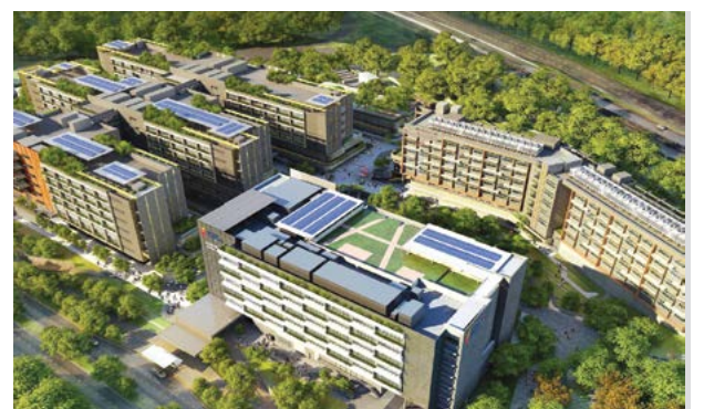
Page 8 Woodlands Health Campus