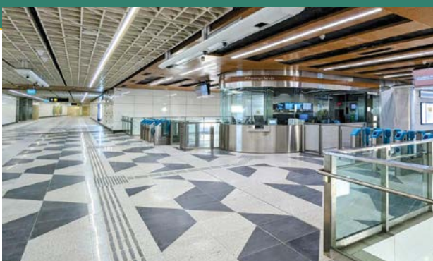
Page 3 Welcome Thomson-East Coast Line Extension to Sembawang GRC

Check out our Hari Raya celebrations across town on page 4