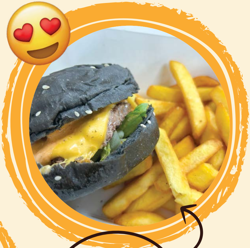
Ashes Burnnit @ Blk 883 Woodlands Street 82