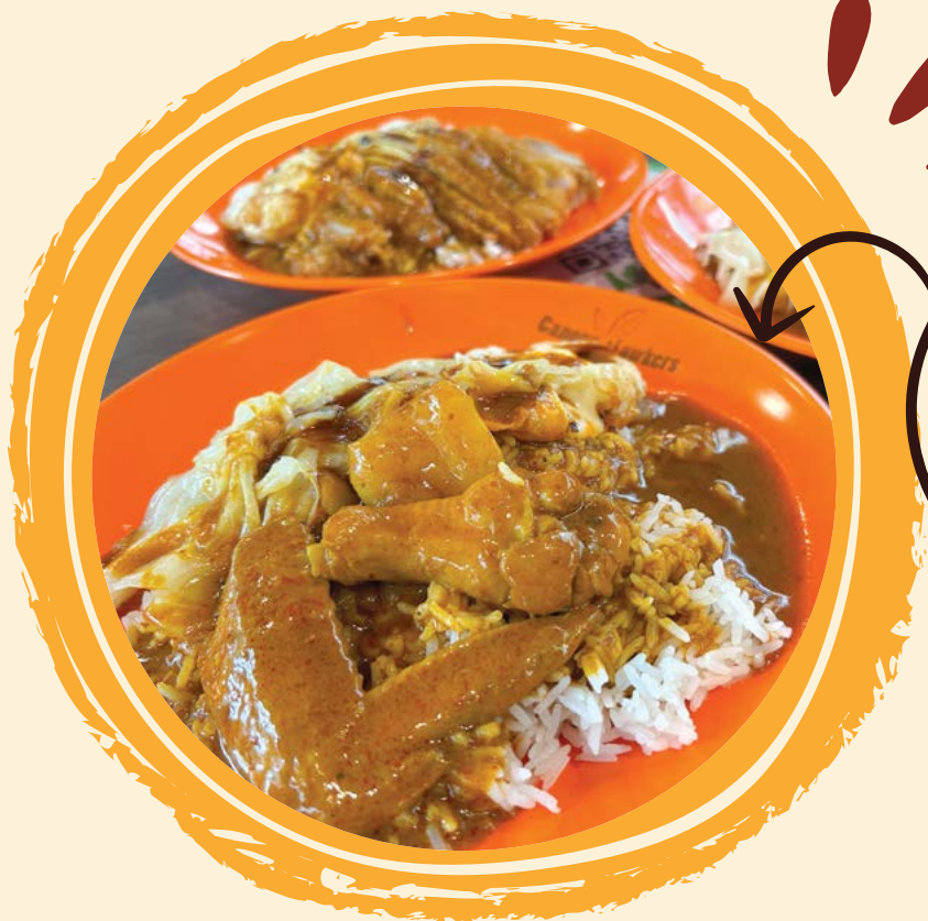
Hock Goo Hainanese Curry Rice @ Bukit Canberra Hawker Centre #01-20